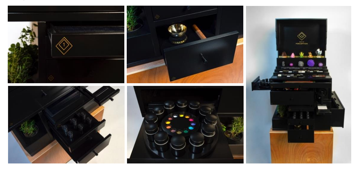
Figure 2: Box of perception.

Out of this research process I developed a toolbox which helps people to re-sensitize. The different tasks, tools and artefacts foster the experience of different sensory modalities more consciously and investigate the connections, translations, and interchanges between senses. The wooden box (Figure 2) contains a considerable number of artefacts which offer different sensory experiences and tasks, e.g., drawing the sound of a singing bowl, mapping smell probes to colours, translate different tactile probes into shapes and colours, or explore tactile artefacts which make taste accessible for sight and touch.